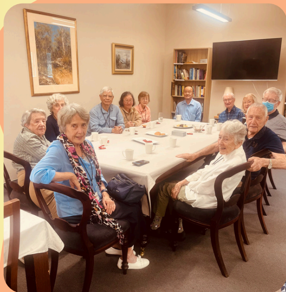
Photos from the Seniors Social Group on 17 th April